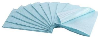
Patient Bibs BLUE 13" x 18" 2-Ply Paper/1-Ply Poly 500/Case $ 24.43 /Case