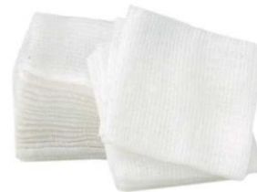
2" x 2" 4 ply Non-Woven Gauze Sponge, 5000/Case $ 23.51 / Case