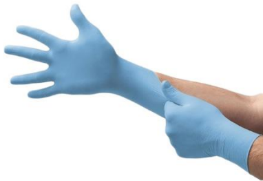
LEONE Nitrile Exam Gloves, Powder Free, Medium, Blue, Non-Sterile, 100/Box $ 11.70 / Box

Upload your recent invoice or purchase list on our contact us page for a full pricing comparison.