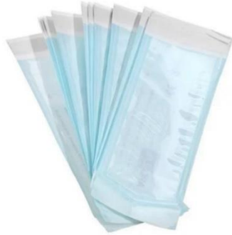
3.5" x 5.5" Self-Sealing Sterilization Pouch, Paper/Blue-Green Film. 200/Box $ 6.89 / Box