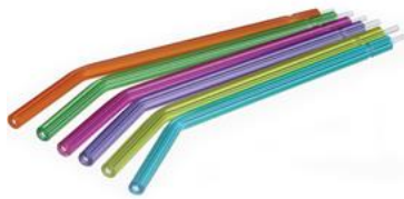
Disposable Air-Water Syringe Tips in Assorted Colors, 250 Tips/Bag $ 13.24 / Bag