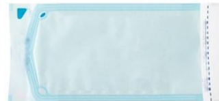
5.25" x 10" Self-Sealing Sterilization Pouch Paper/Blue, 200/Box $ 16.19 / Box