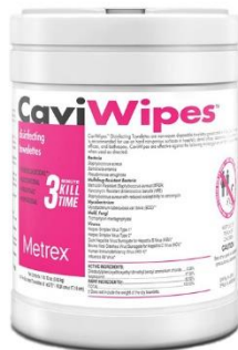
CaviWipes Towelettes (Large: 6" x 6.75") 160 Wipes/Canister $13.98 / Canister