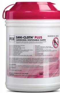
Sani-Cloth Plus Large Wipes (6" x 6.75") 160 Wipes/Canister $8.92 / Canister