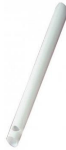
6" High Volume Suction Tips - Vented 1000 pc/Case $ 34.93 / Case