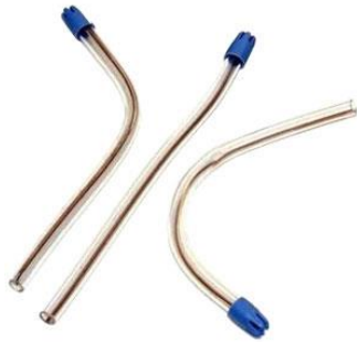
Saliva Ejectors Clear/Blue with Wire-Reinforced Tube, 100/Pk $ 5.27 / Pk