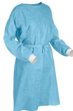
Isolation Gown with Knit Cuff - Blue, one size fits all. 50 Gowns/Pack $56.93 / Pack