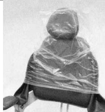
Half Chair Sleeve, 27.5" X 24", 225/Box $ 24.05 / Box