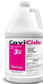
CaviCide Surface Disinfectant 1 Gallon Bottles $24.84 / Gallon