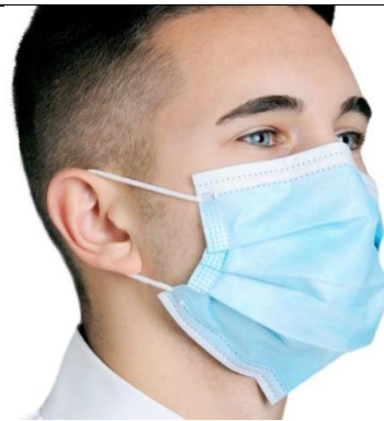
Dual Fit, Pleated, Ear-Loop Face Mask Blue, 50/Box $ 5.82 / Box