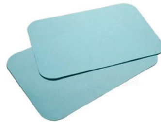
8-1/2" x 12-1/4" BLUE Ritter "B" Paper Tray Cover, 1000/Box $ 24.17 / Box