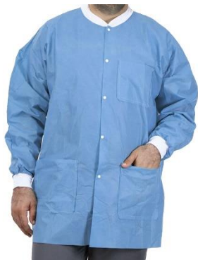
Disposable Lab Jacket, SMS Multiple Layers 50g, Medium, BLUE, 10/Bag $ 28.20 / Bag