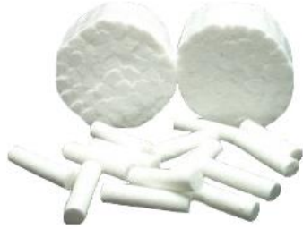
Plain Wrapped Cotton Rolls 1-1/2" x 3/8", #2 Medium, 2000/Box $ 15.95 / Box