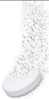
Ultrasonic Cleaning Tablet 64 Tablets/Box $31.53 / Box