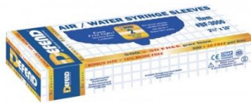
2.5" x 10" Clear Syringe Sleeve Covers, Fits most 3-way air/water, 500 Sleeves/Box $ 16.49 / Box